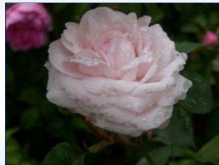
Rose in the gardens of Versailles

See thousands of photos from other StarTribune.com readers and share your own photos and video today.